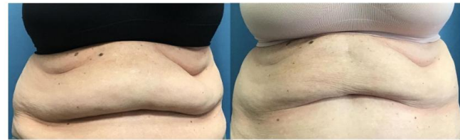
BEFORE individual results may vary 9 WEEKS AFTER One CoolSculpting® Session