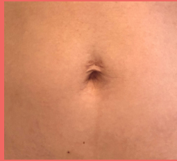
Before and after 3 treatments (abdomen)