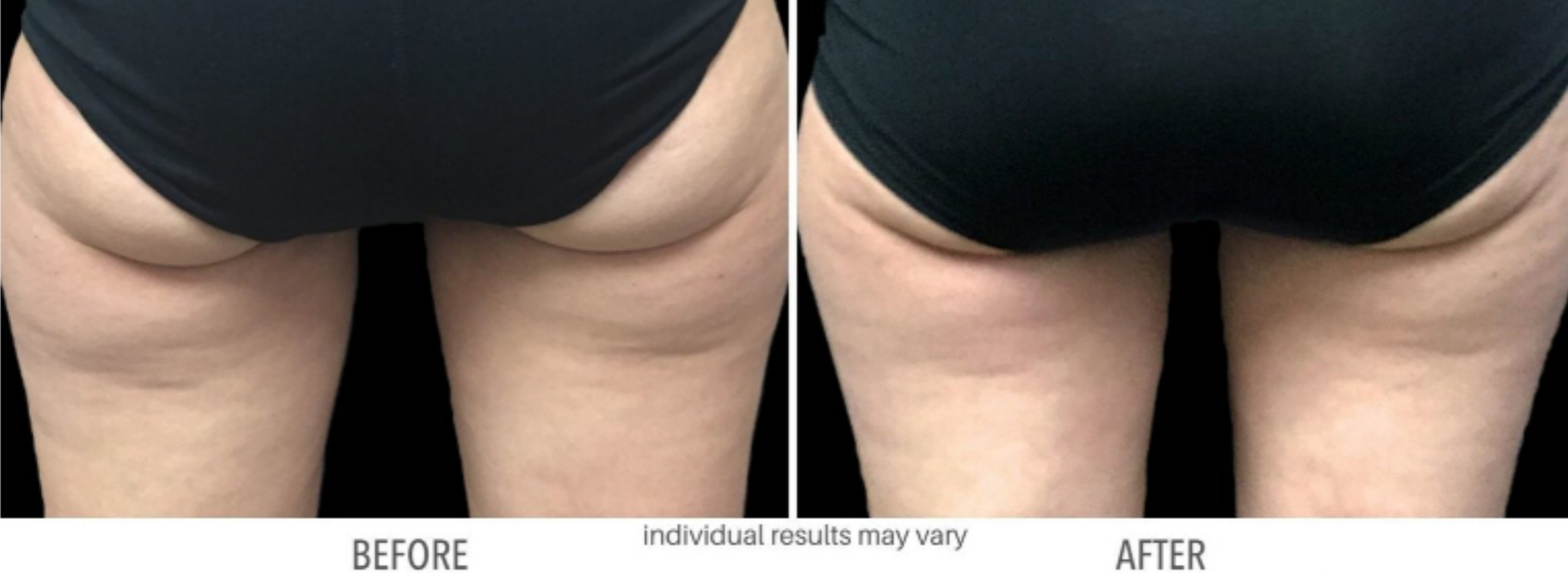
BEFORE Individual results may vary AFTER 27 weeks after 2nd CoolSculpting® treatment