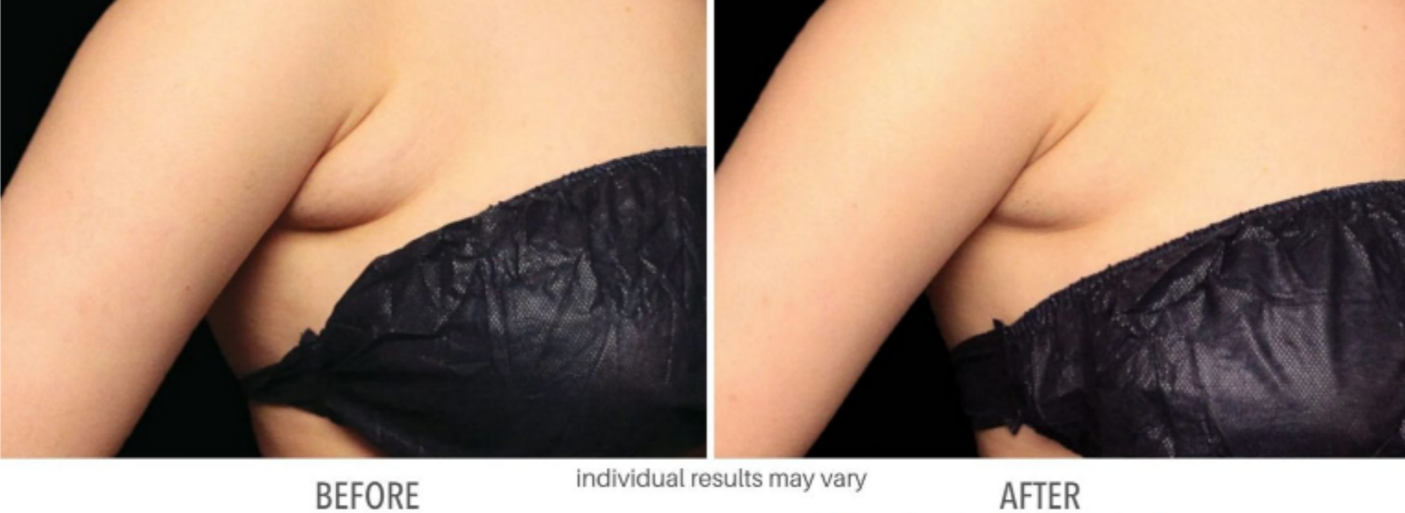
BEFORE Individual results may vary AFTER 12 weeks after CoolSculpting® treatment

CoolSculpting before and after images show the real results from actual patients. As with any cosmetic treatment, results may vary.* However, the results each patient receives in these pictures show how monumental this fat reduction treatment can be when performed by a reputable CoolSculpting provider.