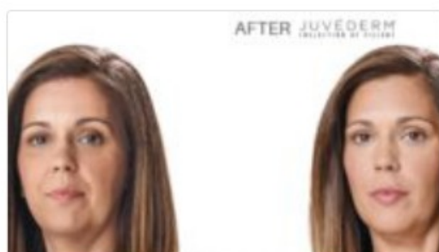
Juvéderm Before and After | Real Patient Results