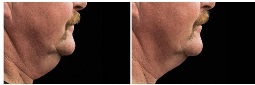
BEFORE Individual results may vary AFTER 12 weeks after 2nd CoolSculpting® treatment

CoolSculpting for men before and after pictures illustrate the fantastic physical transformations these male patients achieved with body contouring. Each CoolSculpting treatment helped reduce fat cells on the patient to reveal a more sculpted, firm body. Experiences may vary, but the CoolSculpting for men before and after pictures show the results that are possible following treatments. *