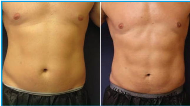
Fig 7, left: Baseline; Fig 8, right: Post Emsculpt

Note, however, that the lipolysis plus Emsculpt protocol is not limited to those individuals who are in need of substantial debulking.