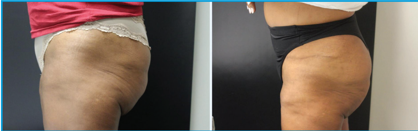
Fig 6, left: Baseline; Fig 7, right: Post Emsculpt

already “fit.” A 59-year-old female patient sought tightening and lift of her buttocks for a more toned appearance. She completed four treatments in two weeks with notable improvement in lifting and toning. (Figures 6,7)