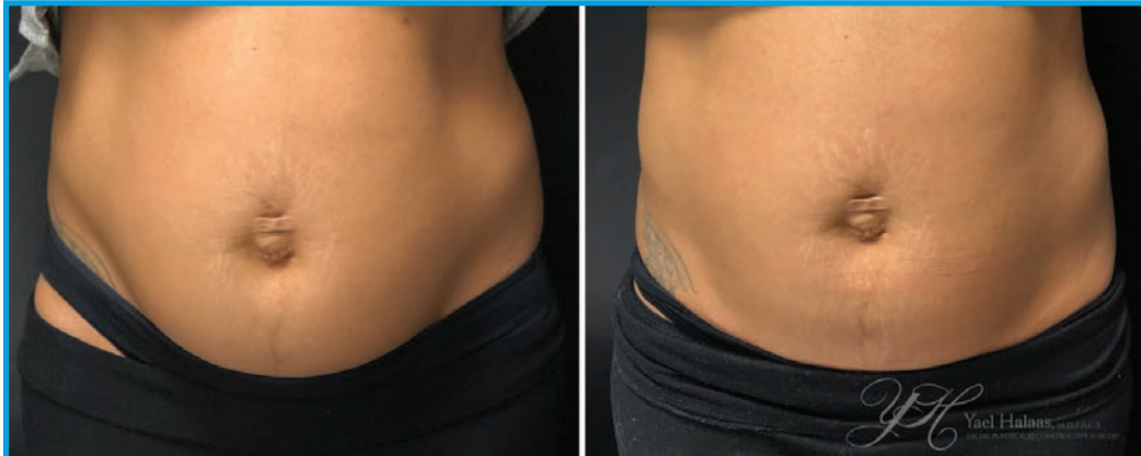
Fig 1, above left: Baseline; Fig 2, right: Post Emsculpt. Figs 3-5, below.

Consider the 43-year-old man who had already undergone four treatments with Vanquish when Emsculpt came on the market. He underwent a series of four Emsculpt