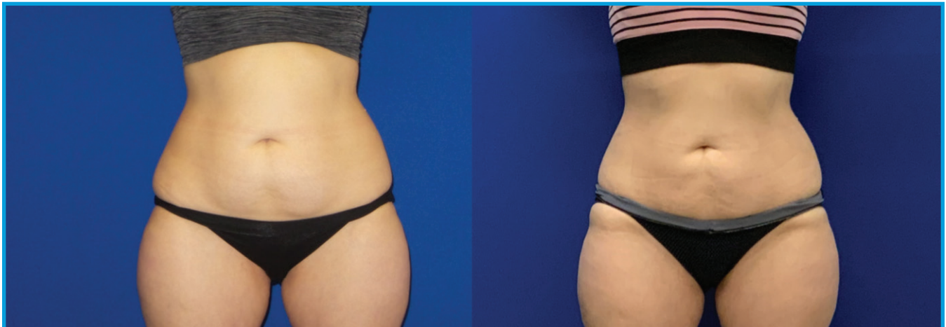
Fig 1, left: Patient post cryolipolysis. Fig 2, right: Patient post addition of Emsculpt

Consider the male patient who underwent four Emsculpt treatments over two weeks plus two Vanquish treatments in the second week. Photos capture a stark improvement (Figures 3,4,5) in terms of body sculpting and toning. However, 3-D analysis demonstrates the extent of the improvement, including a one-inch reduction in circumference that can't be attributed to inconsistent tape positioning and a reduction in the surface area of the torso. (Figures 6,7)