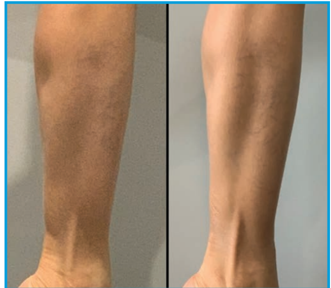
Fig 1, left: Baseline; Fig 2, right: Post Emsculpt

The next phase in body contouring is here. Emsculpt has introduced arm and leg applicators allowing for non-invasive treatment to build muscle and tone. No other energy-based device targets muscle to address this significant patient demand.