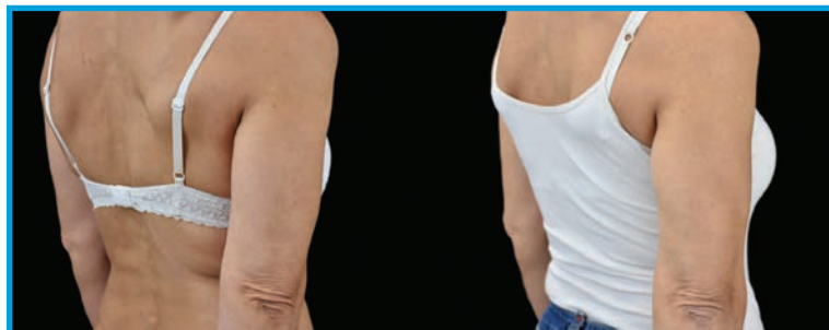
Fig 3, left: Baseline; Fig 4, right: Post Emsculpt