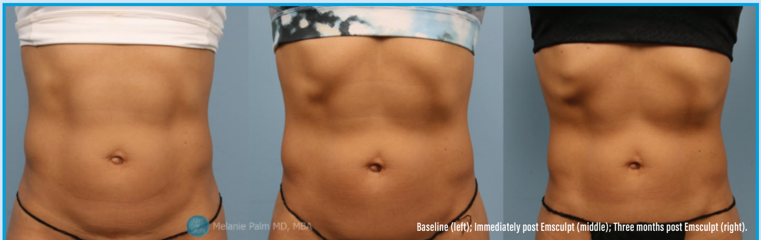
Baseline (left); Immediately post Emsculpt (middle); Three months post Emsculpt (right).

Photos document significant improvement one month after a cycle of Emsculpt treatments, with continued improvement evident at three months.