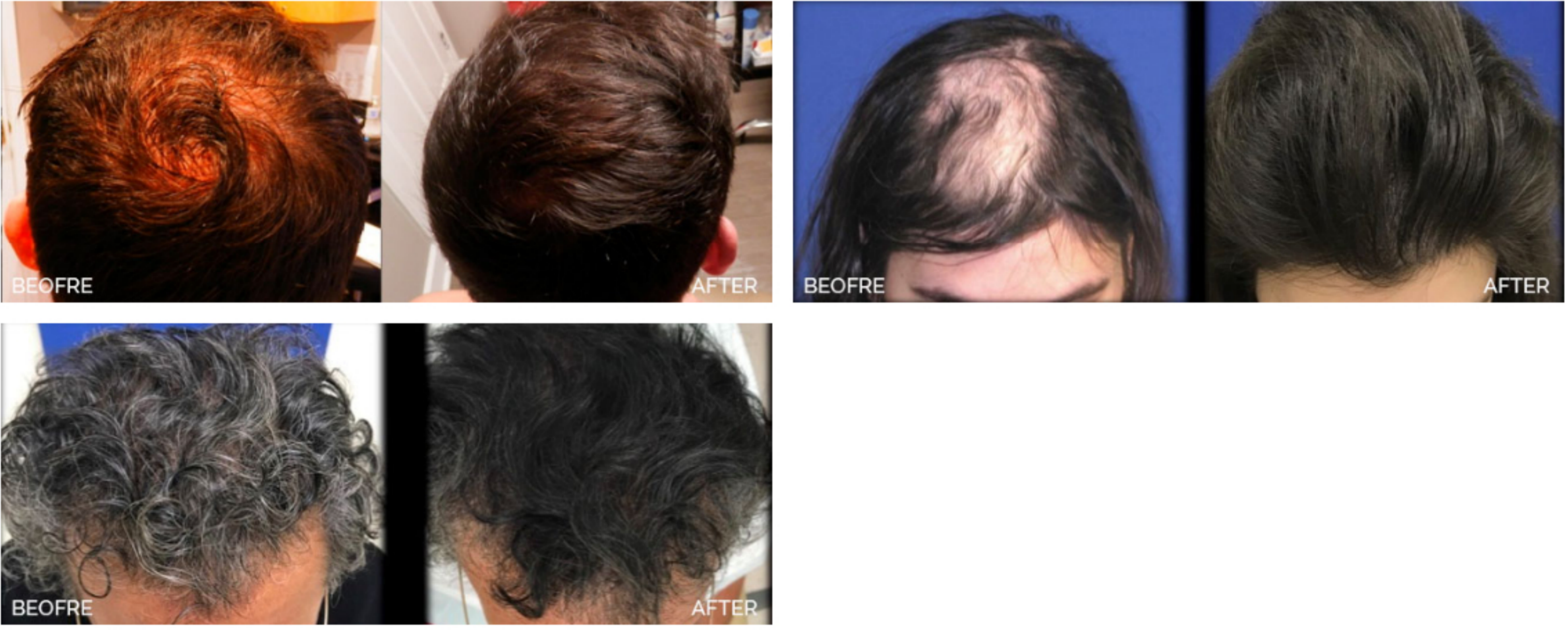
*results may vary